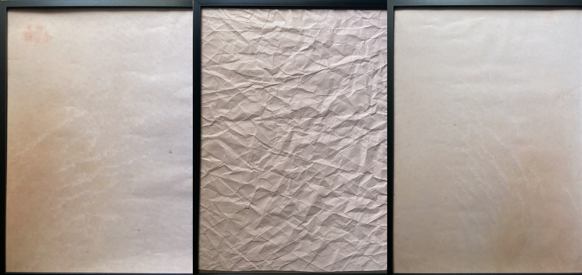
Skóra (Skin/Leather), 2022-2024 acrylic on paper, scans of the artist's body triptych 70 x 50 cm each, framed